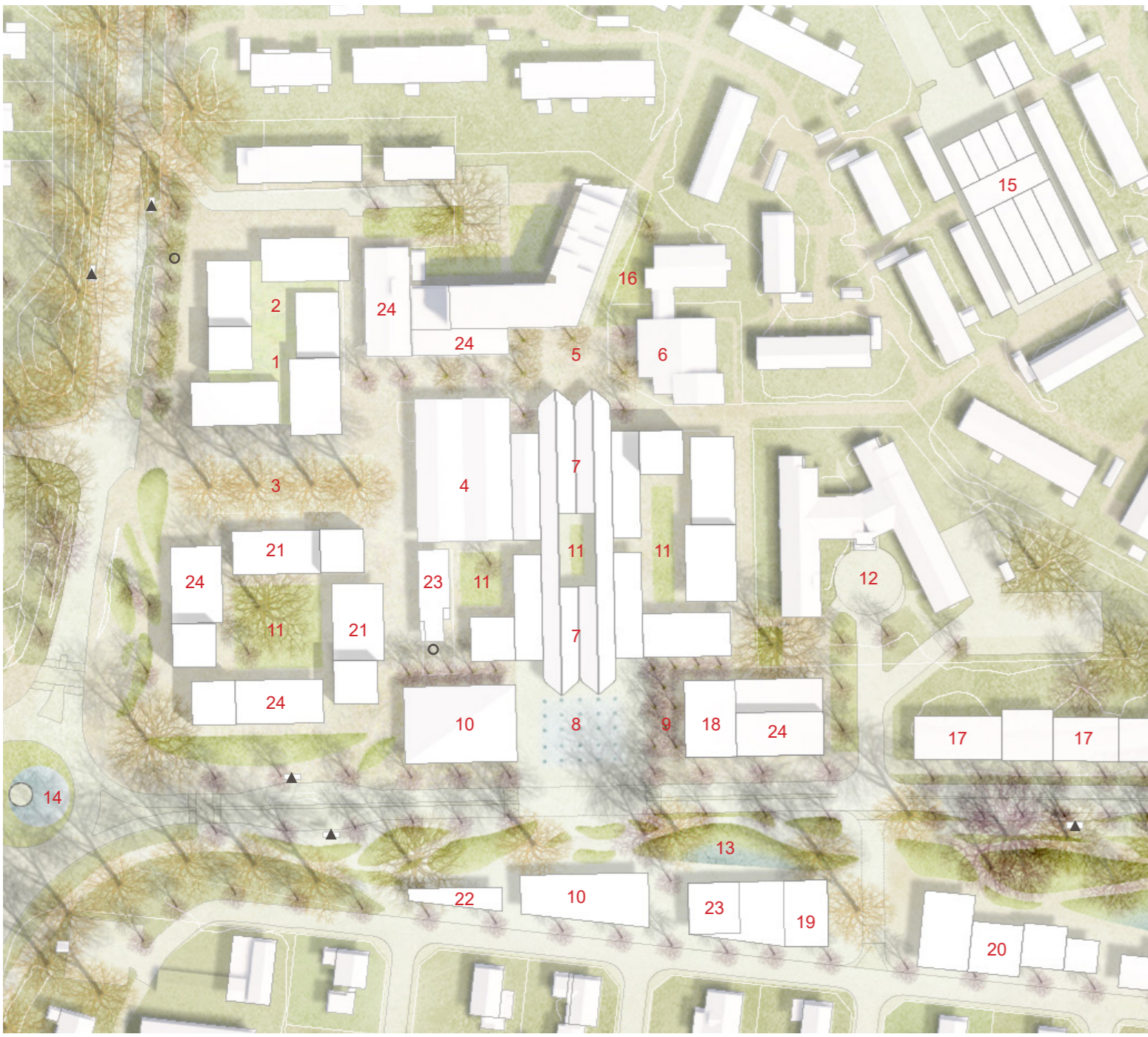
New Håstens Torg Plan