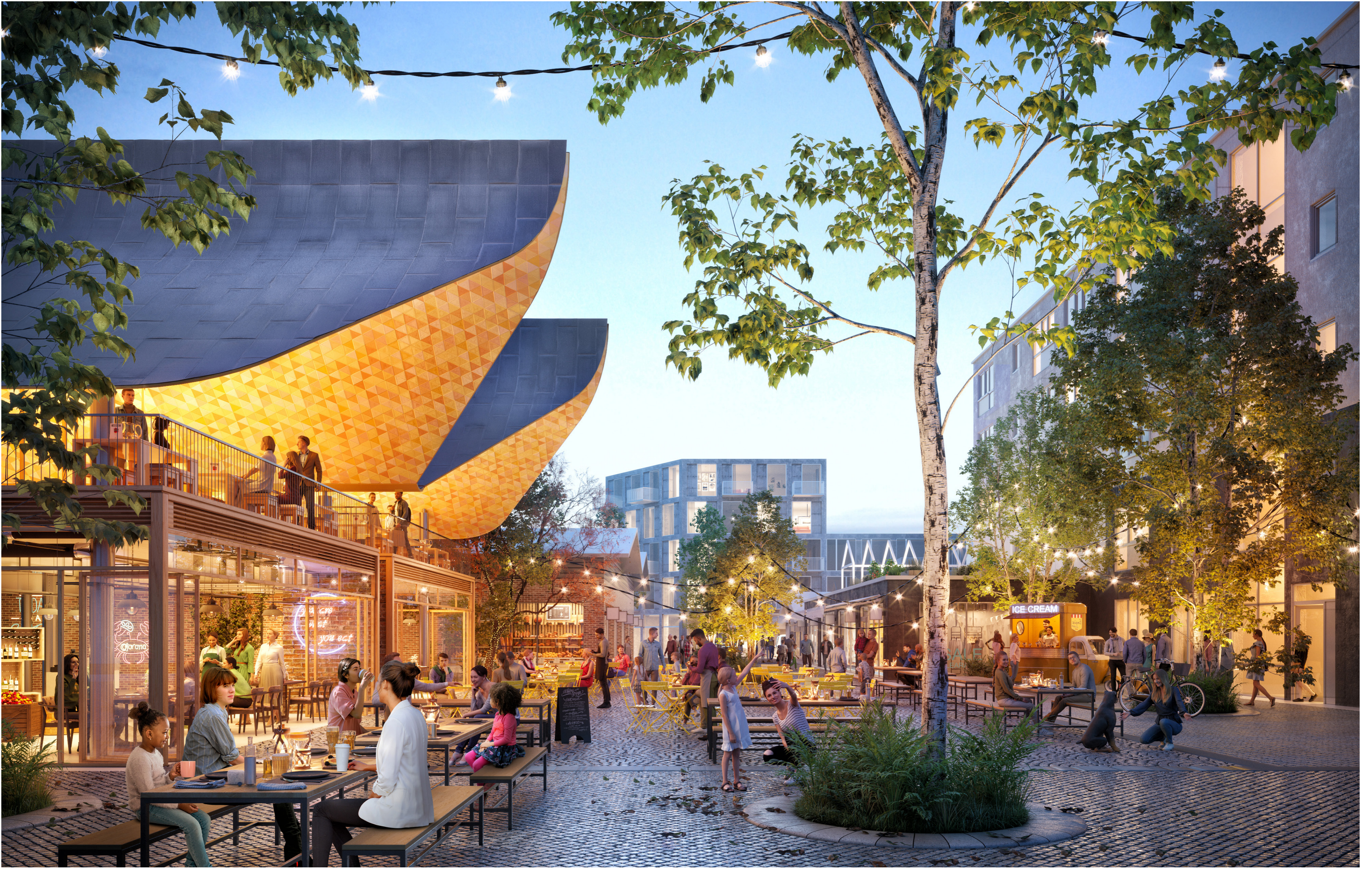
New Håstens Torg View